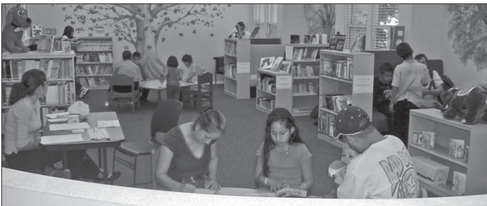
Families enjoy the many services and opportunities offered through the Robert L. Severns Children's Library at Grail Family Services.