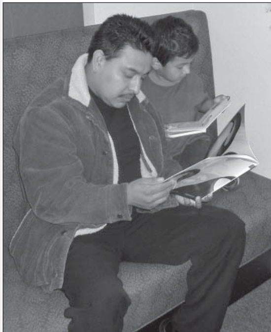
A father models reading in front of his son, one of the suggested activities that are part of the Lee y serás Early Literacy Initiative.

Recognizing the complexity of addressing the low literacy levels of Latino children, the Lee y serás initiative has developed a multi-pronged approach that uses culturally sensitive, research-based curricula targeting family members, day care providers, and community leaders. GFS's role will be to train 60 service providers in San Jose and Oakland on the use of the parent/family workshops curriculum. Starting this summer, providers involved in this project will attend a two-day training and receive all needed materials. The families they serve will receive books and a visit from Scholastic's Family Literacy Caravan.