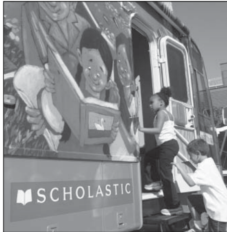
Children enter the Scholastic Family Literacy Caravan, a component of the Lee y serás initiative designed to create awareness in the community. The Caravan will be responsible for distributing books to families.