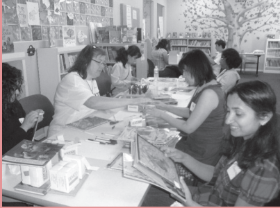
IBM employees label books for the Roberts L. Seaverns Children's Library